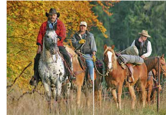
Trail riding or rides on the Swabian Alb.