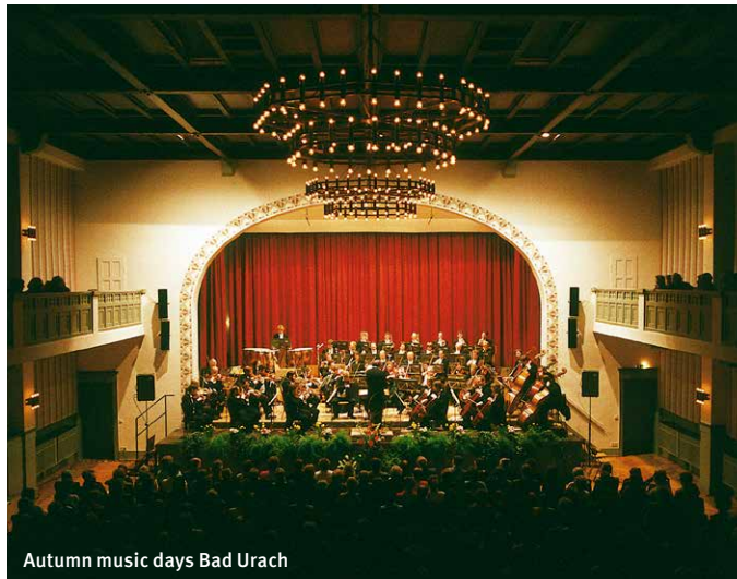
Autumn music days Bad Urach