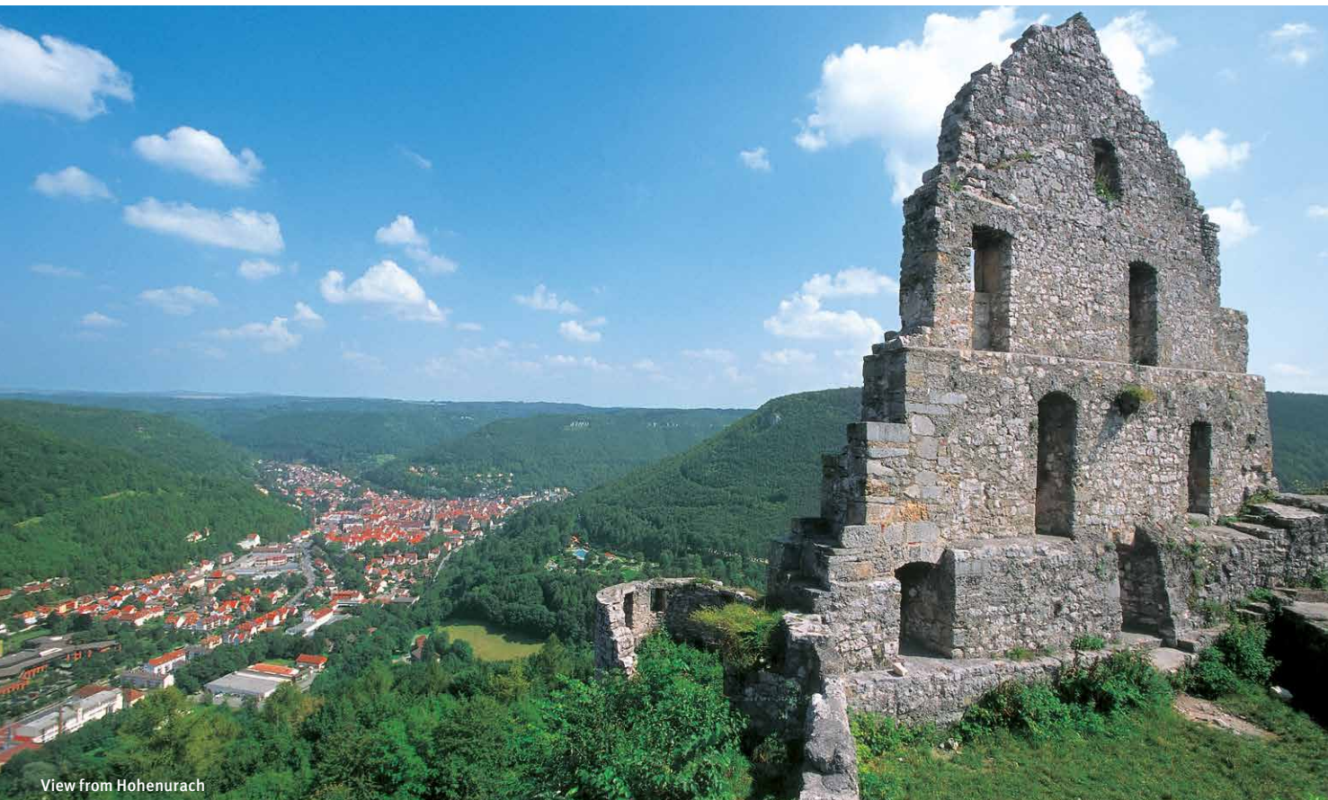
View from Hohenurach

Meet history at every turn. Impressive ruined castles, the romantic castle of Lichtenstein, the baroque minster of Zwiefalten or the picturesque villages of Bad Urach, Münsingen, Hayingen or Trochtelfingen fascinate visitors and locals. Numerous museums show how people have lived, worked and celebrated in ancient times.