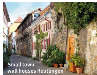
Small town wall houses Reutlingen