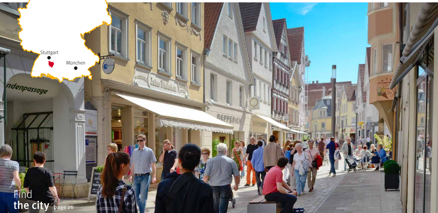
Find the city page 26