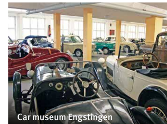
Car museum Engstingen