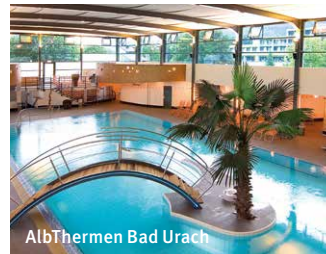
AlbThermen Bad Urach