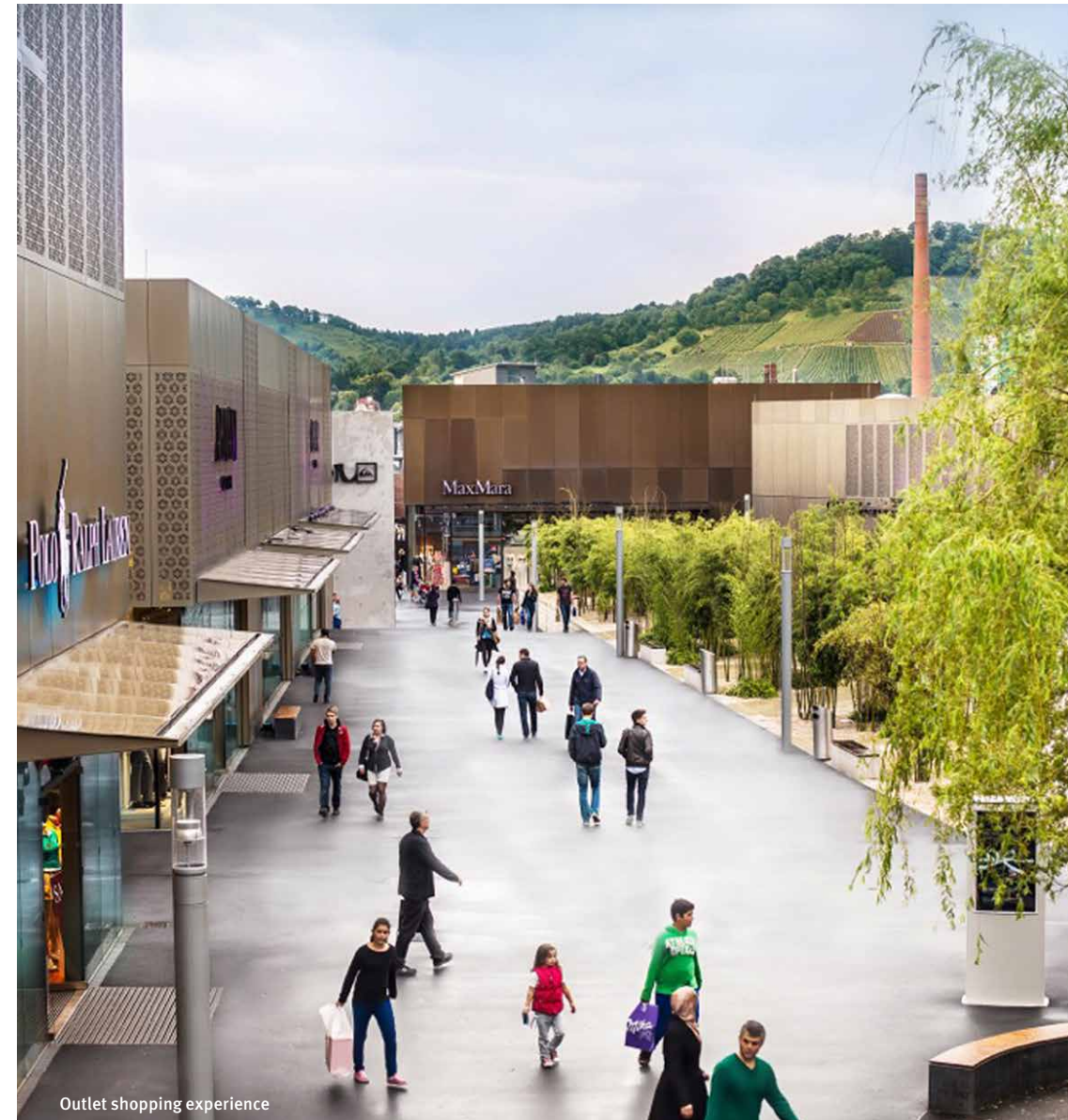
Outlet shopping experience

With more than 3 million visitors every year, the outlet city of Metzingen is one of the most important shopping destinations.