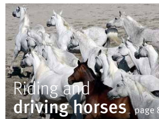
Riding and driving horses page 8