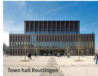
Town hall Reutlingen

Enjoy the outlet city of Metzingen, cultural highlights at the new Reutlingen town hall – or a Spa day at the thermal springs of Bad Urach. Metzingen is the home town of Hugo Boss and you will find there a huge choice of other international brands. With the construction of the new town hall the city of Reutlingen is capturing the cultural scene with musicals, concerts, classical ballet and cabaret. The AlbThermen (spa) in Bad Urach is offering you relaxation time.