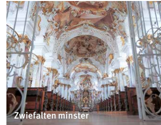
The construction of Zwiefalten minster took more than 25 years.