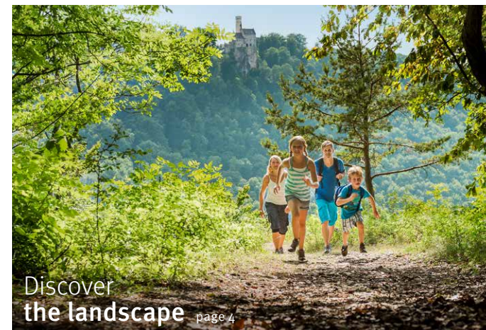
Discover the landscape page 4