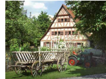
Farm house museum at Hohenstein-Ödenwaldstetten.