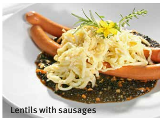
Lentils with sausages

The "Reutlinger Mutschel" is a raised pastry formed like a star.