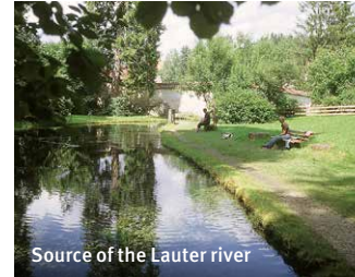
Source of the Lauter river