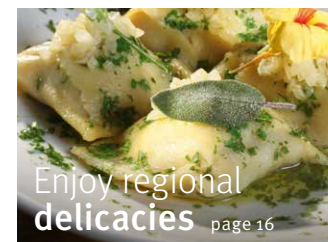
Enjoy regional delicacies page 16