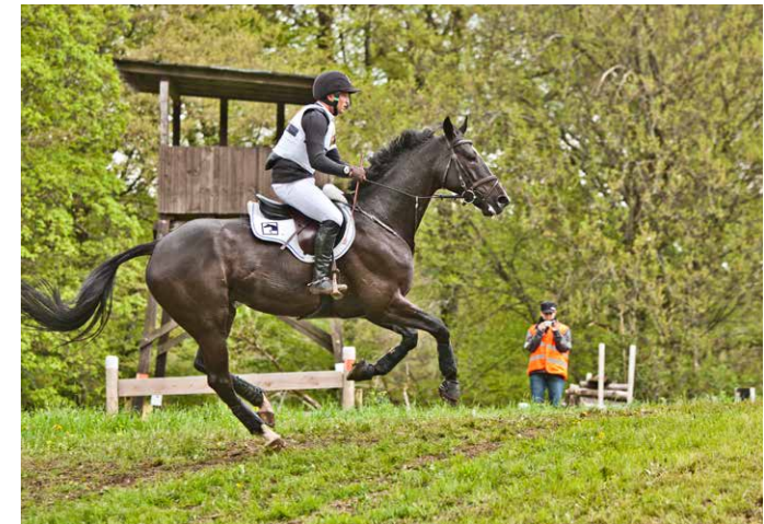
Olympic champion Michael Jung with Halunke FBW at the Marbach Eventing Championship.