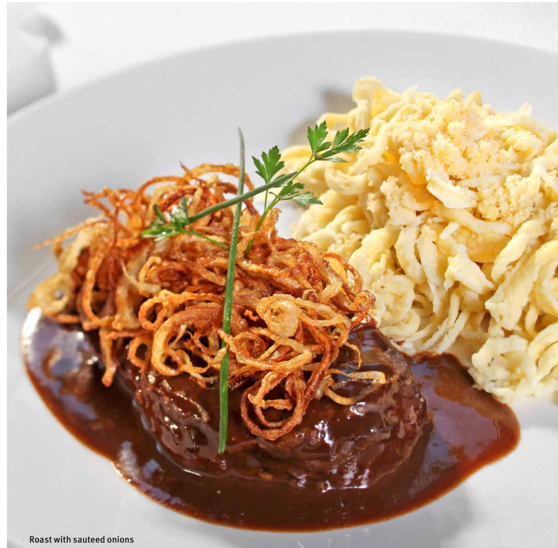
Roast with sauteed onions

Lentils with sausages and Swabian roast are served with typical Swabian pasta.