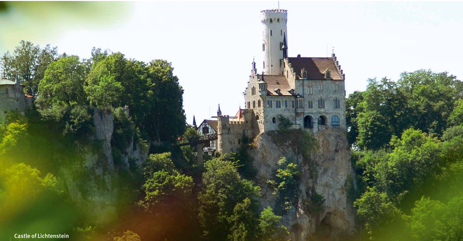
Castle of Lichtenstein