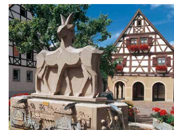
The "goat fountain" in Hayingen.