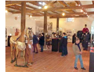
Stud museum Marbach in the former church of the ancient convent.