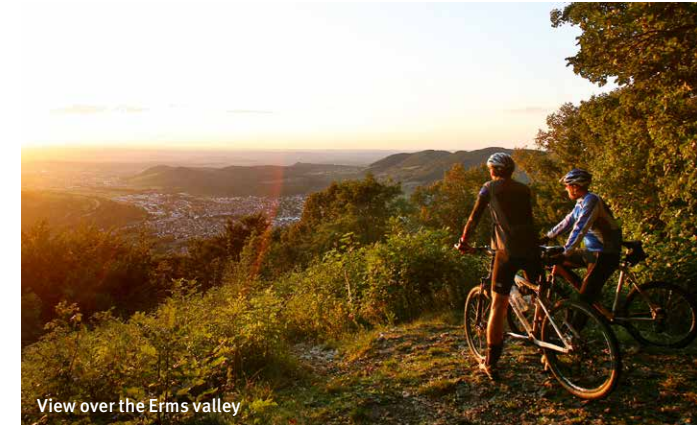
View over the Erms valley