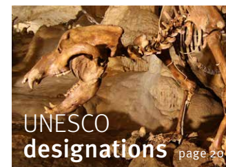
UNESCO designations page 20