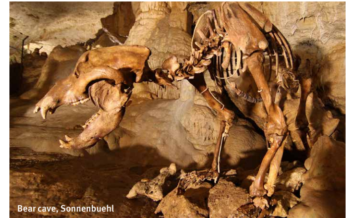
Bear cave, Sonnenbuehl