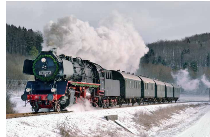
Historic steam engine of the Swabian Alb Railroad.