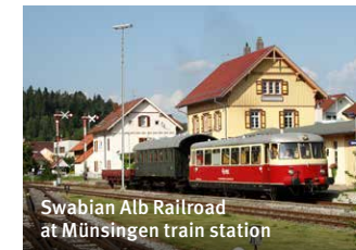
Swabian Alb Railroad at Münsingen train station