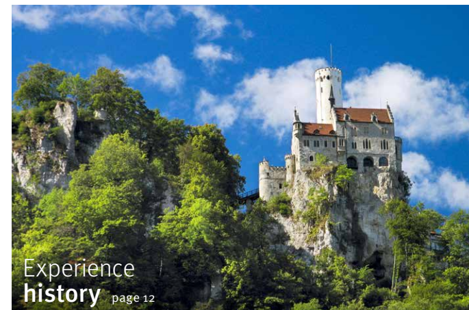
Experience history page 12