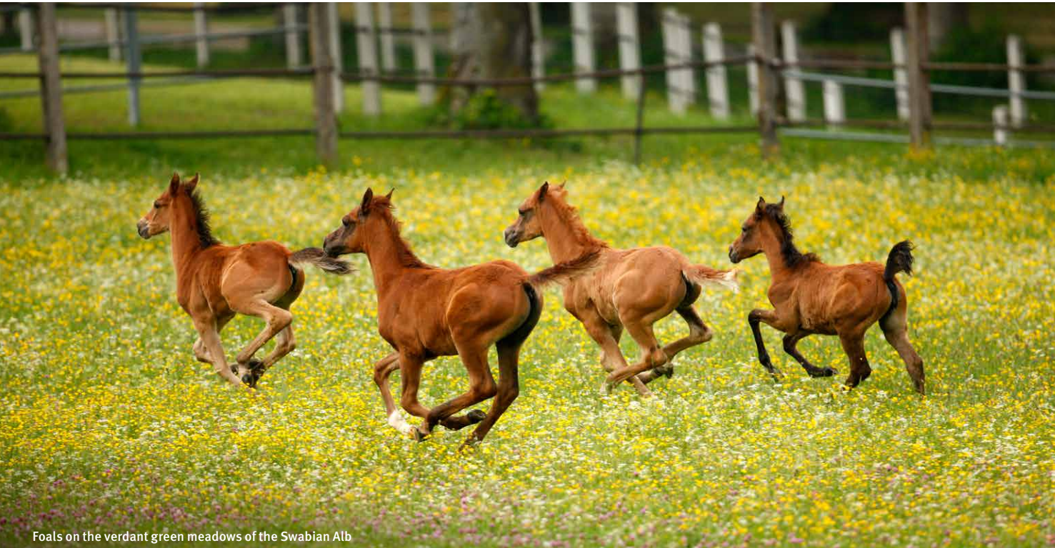
Foals on the verdant green meadows of the Swabian Alb