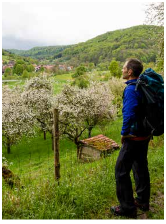
Along the trail you get to know Hohenlohe from its most beautiful side.

There is so much waiting to be discovered along the Jagststeig route. The first sight is situated directly at the starting point in Blaufelden. The medieval fortified St Ulrich Church was built in 1423. The small church features a massive fortified tower with an accessible outer ring wall, which offers some fabulous views of the Hohenlohe Plateau. Another highlight along the route is the town of Kirchberg with its beautiful castle. The former palace, situated on a hill above the River Jagst, is a real gem. In the course of the walk, you can enjoy some fantastic views of the