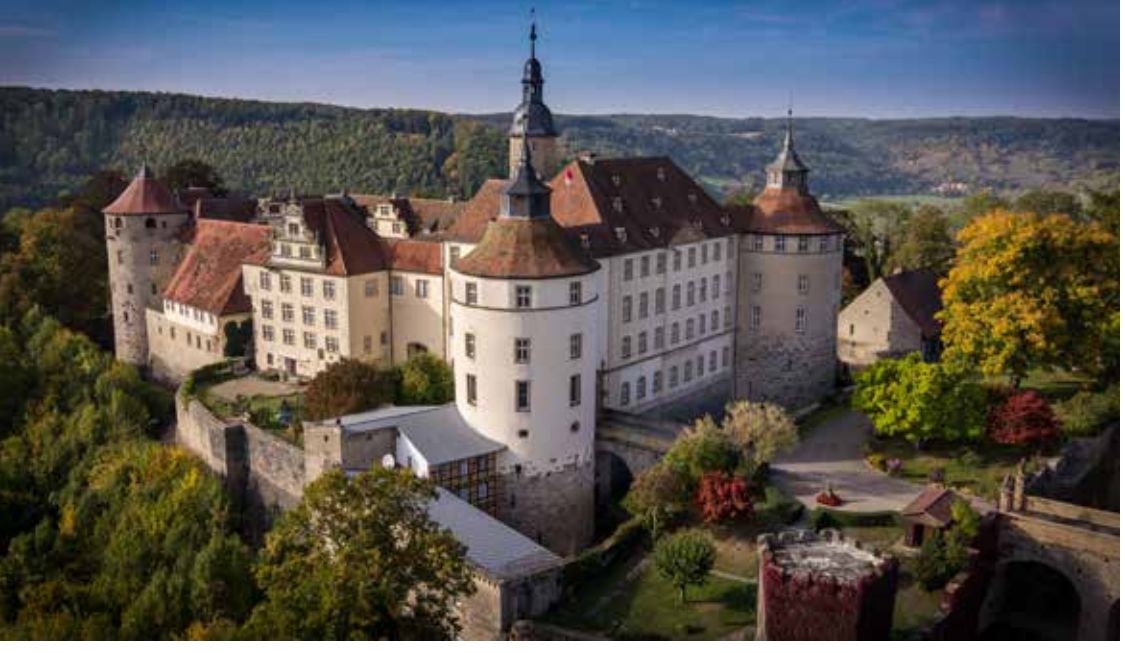
The Langenburg Castle is situated high above the Jagsttal Valley.

idyllic town encloses the historic building, which forms the heart of the scene. So, it is not surprising that the castle has been used for cultural events since 1967. The current castle originated from a prior fortress that is believed to have been built in 1265. In the years after 1590, the medieval castle was remodelled as a Renaissance palace.