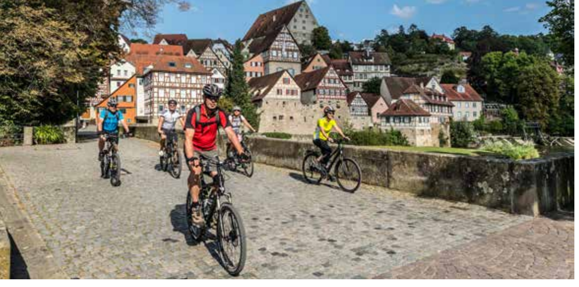
The cycling track runs through Schwäbisch Hall.