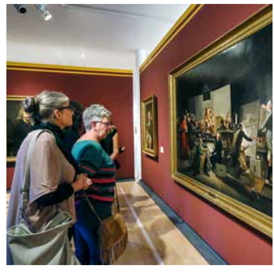
The "Kunsthalle Würth" Gallery in Schwäbisch Hall houses yearly changing exhibits from the Würth collection

In Wackershofen, visitors can travel even further back in time. The open air museum, which was opened in 1983 and is one of seven of its kind in Baden-Württemberg, welcomes around 100 000 visitors per year on average and is very popular among families with children. The