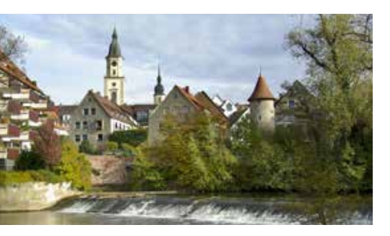
The River Jagst at Crailsheim with the town hall in the background.

Despite its relatively small size, the town of Schwäbisch Hall is well-known to almost every German – and this is not only because of the building society bearing the same name and its catchy TV advertising. Schwäbisch Hall attracts visitors from around the world to Hohenlohe and it is considered one of the most beautiful towns in southern Germany. In medieval times, the city became famous for being an important centre for salt boil-