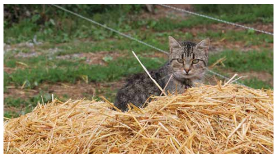
The well-being of their animals is a top priority for the owners of the "Jagsttalranch" Farm.

meadows and forests. The mill was built at this place in 1804. It was mainly used to manufacture numerous tools such as agricultural and forestry tools. A special feature of the beautifully situated cultural monument is the water-driven trip hammer, which means that the mill can be operated without electricity. The mill had been in operation until 1948. Today, visitors can explore the mill, the former home of the blacksmith, and a historic oil mill. which was installed afterwards in the museum. It is also possible to attend a live show, in which volunteer master smiths demonstrate how the tools were produced. On the museum's event days, visitors will even have the opportunity to try their hands at manufacturing tools.