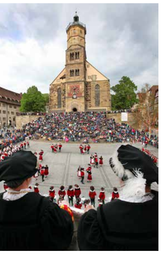
Performers present medieval traditions at the "Kuchen- und Brunnenfest"

A German proverb says, "One should celebrate the parties as they come" – and many festivals are celebrated in Hohenlohe throughout the year. Several traditional events provide a lot of amusement throughout the entire region.