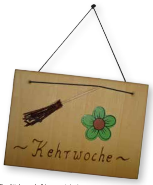
The "Kehrwoche" imposed duties on individual households regarding order and cleanliness inside the common property. It is practiced in Swabia and Hohenlohe.

In order to answer this question, it is sufficient to have a brief glance at the every-day life in Hohenlohe, that is, right at the centre of the scene. Visitors and locals alike are cordially welcomed. Regardless of whether they meet in one of the many wine taverns and restaurants, or at one of the numerous festivals in the region, the people from Hohenlohe love sitting together. Thanks to the relaxed atmosphere and the openness of the locals, everyone