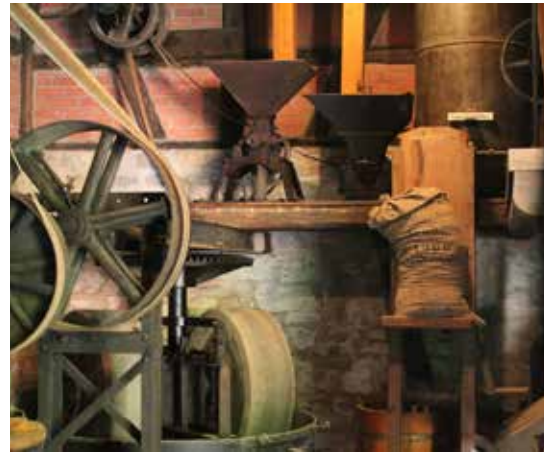
The historic oil mill was installed afterwards in the museum.

Those who prefer a more relaxed atmosphere, but still want to spend an exciting day in the lovely countryside, should pay a visit to Gröningen, which is not too far away from the railway station in Laufen. Gröningen is a district of the town of Satteldorf and is around 45 minutes away by car from Laufen. There is a car park just a few metres after leaving the town towards Bölgental. You can leave the car there and follow the downhill trail into the picturesque Gronachtal Valley. The hammer mill in Gröningen is situated directly on the banks of the River Gronach - far away from the noise of the town - and is surrounded by a sea of ▶