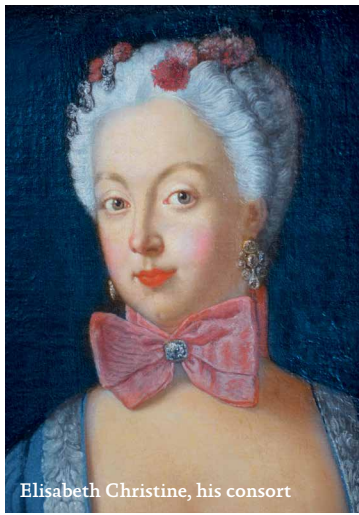
Elisabeth Christine, his consort