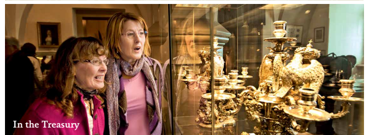
In the Treasury