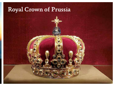
Royal Crown of Prussia

On a beautiful summer evening in July 1819, 23-year-old Crown Prince Frederick William of Prussia paid a visit to the ruinous ancestral seat and decided its reconstruction.