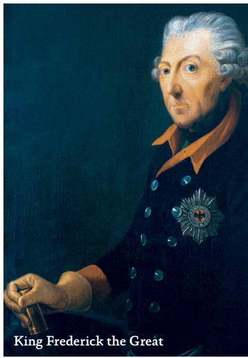
King Frederick the Great

On the left a King, on the right an Emperor – and you are in the middle!